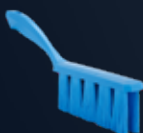
UST Bench Brush, Soft Art. no: 4581x