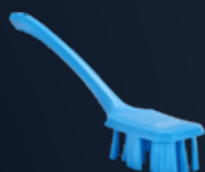
UST Long Handled Hand Brush, Stiff Art. no: 4196x