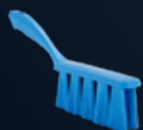
UST Bench Brush, Medium Art. no: 4585x